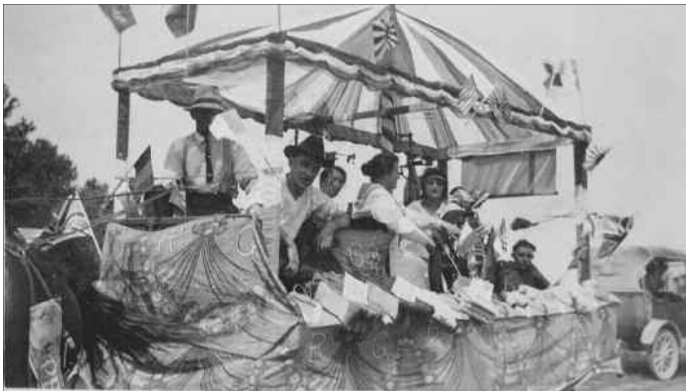
7006 On the back of this photograph is written “July 1919,” which suggests this float might have been part of a “peace day” parade in Mitchell. (2)