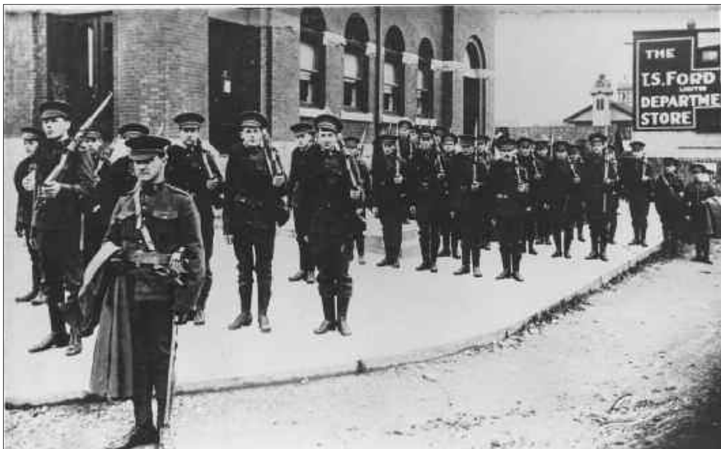
7003 Reserves on parade in front (north side) of the Mitchell post office and customs building near the end of the First World War. Almost a block beyond the T. S. Ford Department Store sign is the town hall, after it had been moved to the corner of St. George and Quebec streets. At this end of it, the rear, is the tower used for drying the fire department's hoses. At the front is the bell tower.