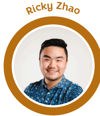
Tourism Officer (Contract)