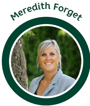
Director of Economic Development

The Economic Development & Tourism team is here to support businesses, residents, and visitors with a range of programs to help Perth County grow & thrive. Our office is always open and we're just a phone call away.