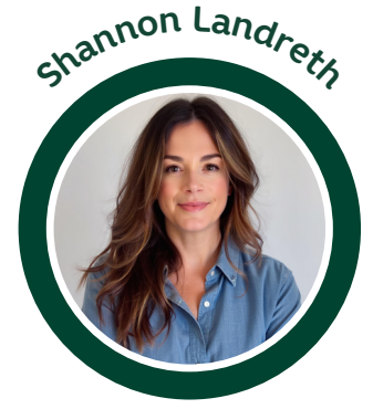
Economic Development Officer (Contract)