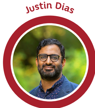
Economic Development Officer